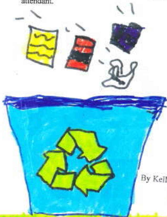
By Kellsie Flint

Aluminum Cans - soda, beer, and some pet food cans if they are white on the inside, if you can bend it with your fingers, it is usually aluminum; if not, then it is tin, which goes in a different container. Ask the attendant.