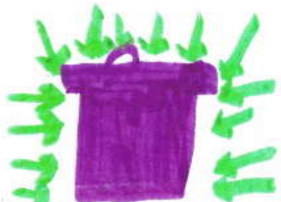
By Henri Walsh

All of the recyclables have signs on the front of the building identifying where they should be disposed.