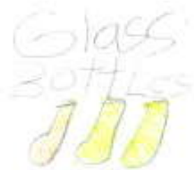
By Phoebe Boivin

Newspapers - There is a table for the newspapers. They should be cleaned of all the glossy inserts. The glossy inserts go in the mixed paper.