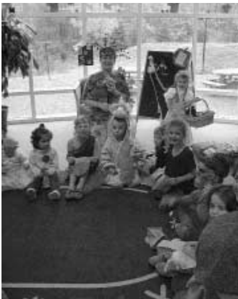
Halloween Storytime paraders show off their costumes.