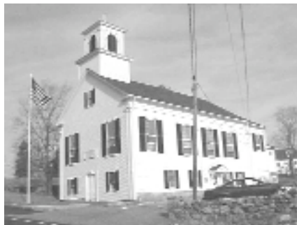
Rye Town Hall

Geothermal HVAC Grant. As reported earlier through this newsletter, in 2010 the town was awarded $138,053, substantially