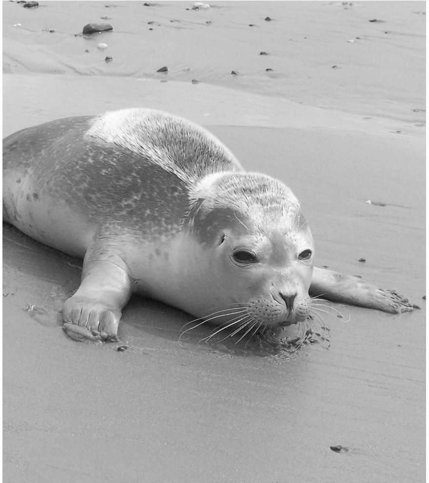
This Harbor Seal pup visited Jenness Beach recently.

Once the evaluation is complete and the various points are added up, a numerical grade will be assigned somewhere between 1 and 10 (1 being the best and 10 the worst) Following the ISO visit in 2007, Rye's classification remained at 5/9. That means that any property within 5 miles of the fire station and 1000' of a fire hydrant falls into Class 5 and others into Class 9 which would pay a higher premium for fire insurance.