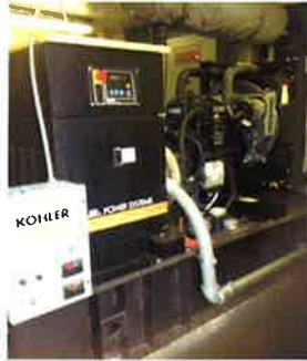
New generator at Jenness Beach Pump Station

This summer, the generator at Jenness Beach Station failed unexpectedly and was replaced at a cost of $24,782. In addition, the Sewer Department was notified last minute by the State of NH of paving on Route 1A and incurred the cost of purchasing and installing manhole risers. The current budget was adjusted to accommodate these unexpected expenses.