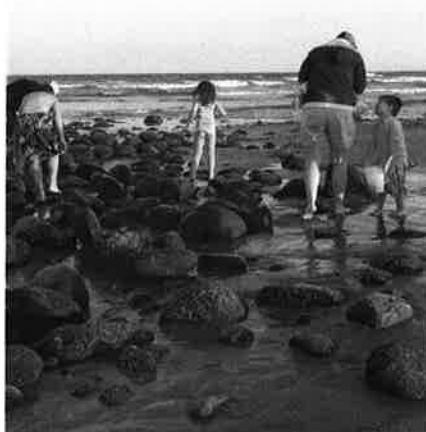
A family searches for crabs at Jenness Beach, Photo by Michael Labrie

In the proposed ordinance, activities conducted for fee or rent have been carefully defined as have the locations to which they apply. If approved, these activities must conform to requirements set forth in the ordinance which ensure safety for the participants and protect the Town from liability.