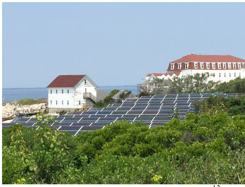
Star Island Solar Panel Array installed in 2014

SERVE is very appreciative of the community's response to our calls for volunteers that have appeared in this Newsletter. New volunteers for all programs are always welcome. You choose which activity interests you and fits into