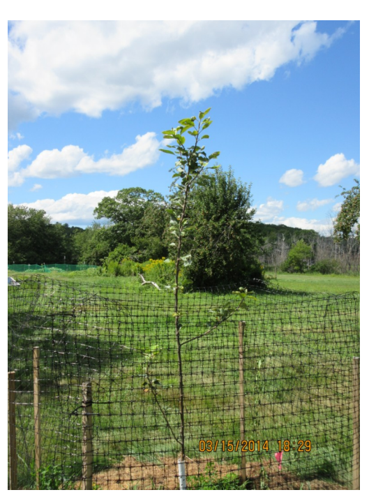
Newly planted apple tree/deer fencing at the Community Garden at Goss Farm

The RCC appreciates that residents continue to support open space,